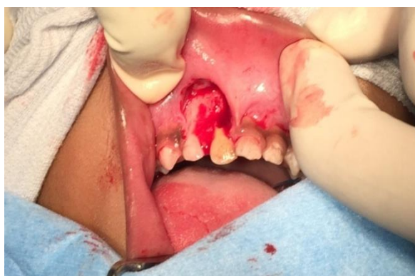
Figure 3: Intraoperative: Excision of the growth

Histopathological examination suggested-“parakeratinized stratified squamous epithelium with thin and elongated rete ridges exhibiting pseudoepitheliomatous hyperplasia. Proliferating connective tissue stroma was moderately collagenous with moderate cellularity. Long slender spindle shaped cells and plumb spindle shaped cells were seen arranged in a streaming pattern. Few areas showed irregular arrangement of spindle cells. At the central areas the cellularity was intense with same type of cells. In some areas the spindle cells were arranged in herring bone pattern. Through out the stroma, nucleus was bland and vesicular in nature. Vascularity was moderate with many formed blood vessels in which some of them are engorged. Inflammatory infiltrates were minimal”.