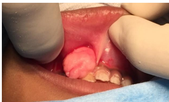
Figure 1: Preoperative findings Swelling in relation to 51 and 52