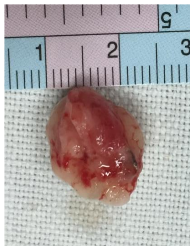
Figure 4: Excised specimen

On examination, a 2.5x1.5cm sessile, pinkish, multilobular growth was seen in the gingiva above 51 (temporarily filled access opening) and 52. (Figure 1) Growth was firm and nontender on palpation. 51 was palatally displaced. There was no associated dental mobility and 51 was nonvital. IOPA X-ray revealed RCT treated 51. Based on history and previous histopathological report (RCC), diagnosis of myofibroma was made. Lesion was excised along with 51 and 52 under general anaesthesia. (Figure 3, Figure 4)